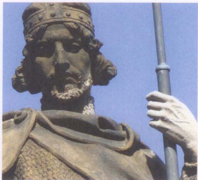
STATUE OF SAINT WENCESLAS, PRAQUE

Acts then tells how Stephen did great wonders and signs among the people and debated with certain Jews of the Synagogue of Freedmen. Those he debated brought him up on charges of blasphemy before the Sanhedrin , the supreme Jewish court, saying he had spoken against God and Moses.